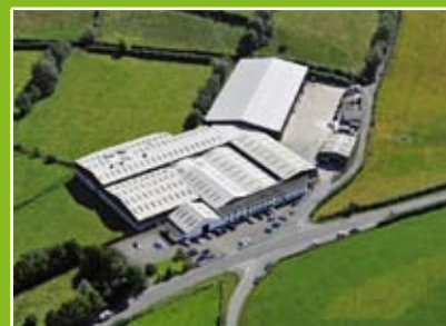
Production facilities of 500,000 sq ft located across 40 acres in Co.Antrim and Co.Tyrone. Left: Steeple, Top Right: Greystone Rd, Bottom Right: Benburb

Units 4-7 Steeple Road Industrial Estate, Antrim, Northern Ireland, BT41 1AB Tel: 028 9446 2419 Fax: 028 9442 8138 ROI Tel: 048 9446 2419 ROI Fax: 048 9446 4002 Web: www.inlitenwindows.com Email: info@inlitenwindows.com