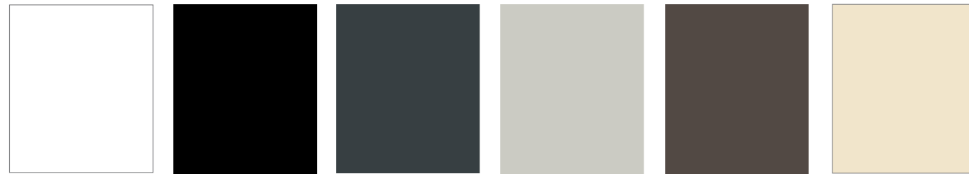
White (9910 high gloss) Black (9011 semi gloss) Grey (7016 matt) Silver Grey (7035 semi gloss) Brown (BS08-B29 semi gloss) Cream (1013 semi gloss)

Bi-fold doors can be coloured on one or both sides, and feature a matt or gloss finish depending on your chosen colour (other RAL colours available upon request):